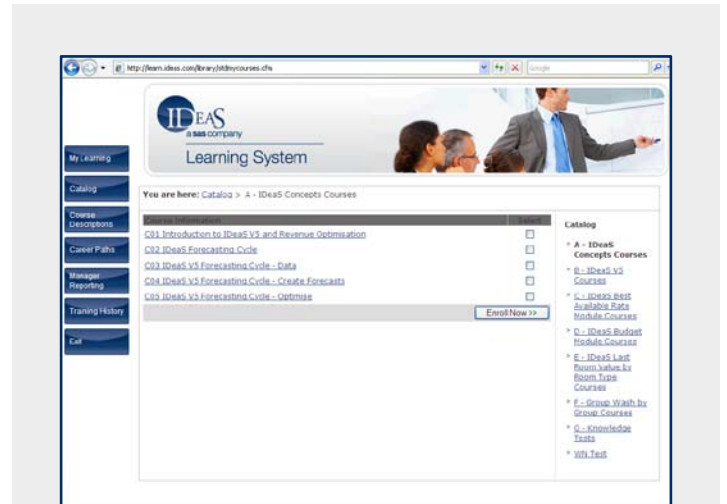
IDEaS Learning System Course Catalog